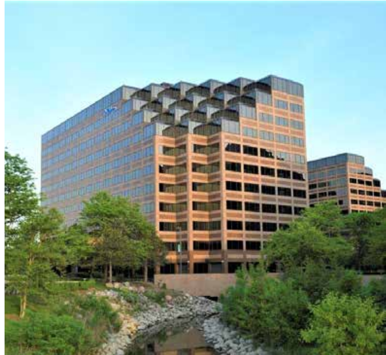
6133 N River Road