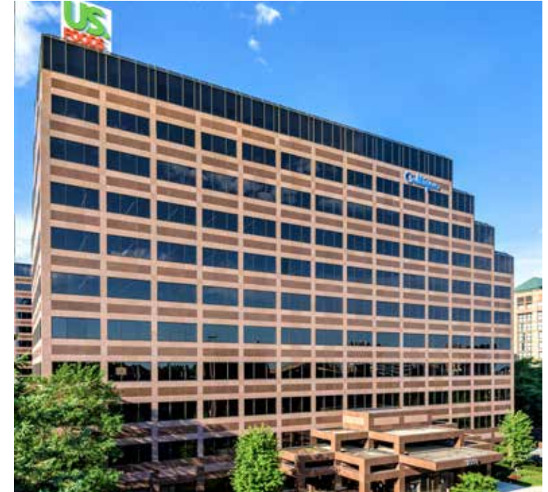
9399 W Higgins Road