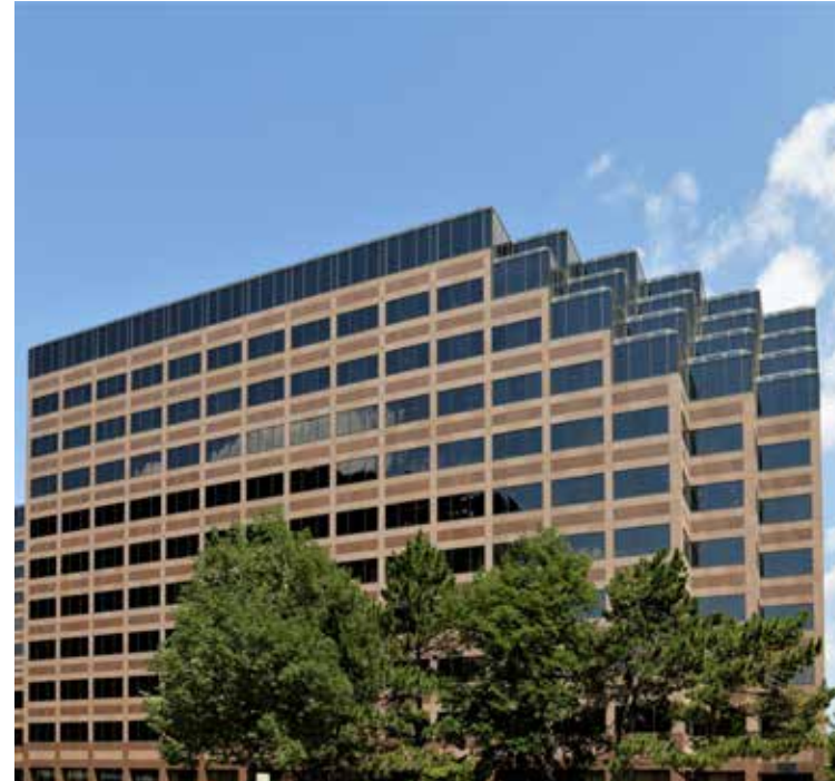
9377 W Higgins Road